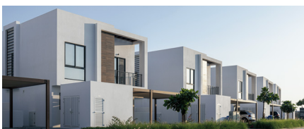
Private residential homes