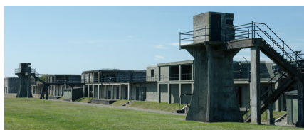
Temporary army bases